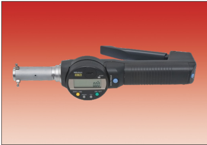
Three-point internal micrometer Modification: 3x special measuring feeler (ball) for the measurement of pipe beads