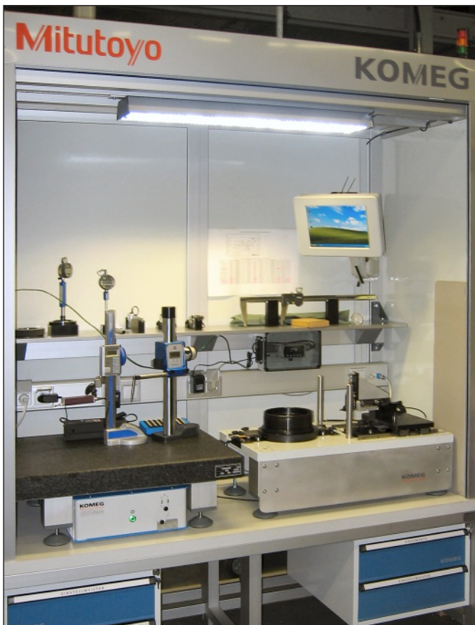
Measured value transmission by means of wireless transmitter/ receiver module. Workbench with various hand measurement tools

Note: All our product details, in particular the illustrations, drawings, dimensional and performance details and other technical specifications contained in this publication are to be considered to be approximate average values. To this extent, we reserve the right to make changes in design, technical data, dimensions and weight. Our specified standards, similar technical rules and technical specifications, descriptions and illustrations of the products are correct at the time of printing. The current version of our general terms and conditions also apply. Only offers which we have submitted can be considered to be definitive.