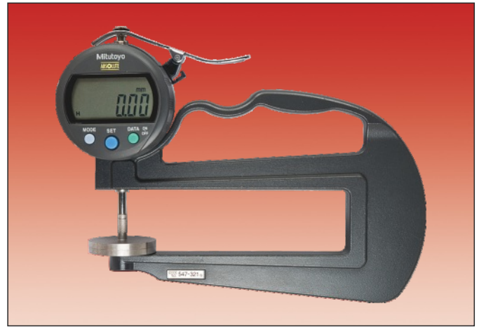
Mitutoyo Digimatic Dial snap meter Modification of the measurement counter of steel for the measurement of textile thickness